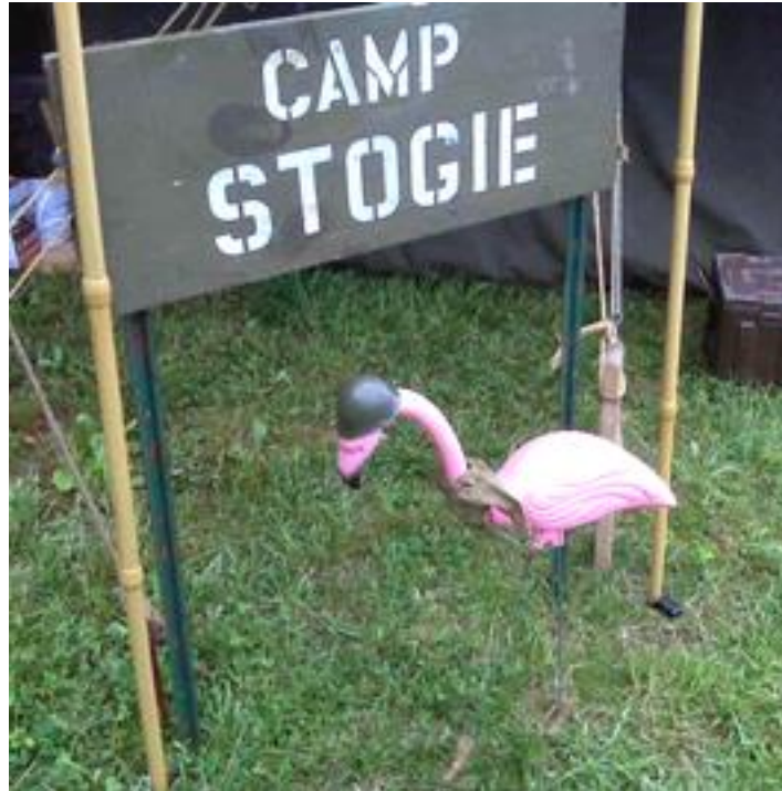
Camp Stogie Sentinel